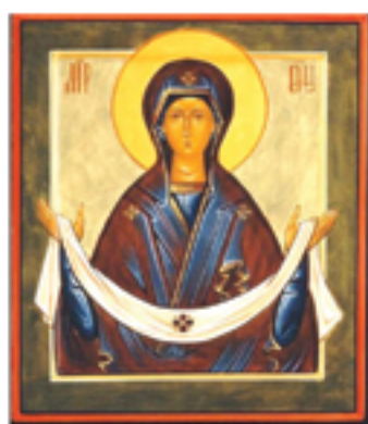
Protection of the Mother of God

This issue of indissolubility of the marriage contract and its consequence upon the family constellation; the place of continual conversion on the part of the couple who are united in covenantal love and the concept of "vocation" in the married state, will be among the topic discussed in the next installment.