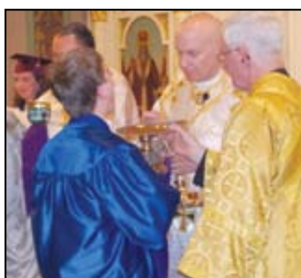
The distribution of the Bread of Life.